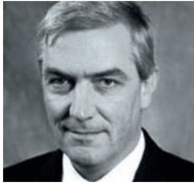
LEO THOMAS SCHRUTT

is a German scientist and politician. He is professor of health economics and epidemiology at the University of Cologne. He studied human medicine at the RWTH Aachen University, University of Texas and University of Düsseldorf. From 1989–92 he has studied health policy and management as well as epidemiology at the Harvard School of Public Health in Boston, graduating with a Doctor of Science in 1992. From 1992–93 he has held a fellowship at the Harvard Medical School. Since 1998 he has been director of the institute of health economy and clinical epidemiology at the University of Cologne and was appointed adjunct professor at the Harvard School of Public Health in 2008. He was a member of the “Council of Experts for the development of health system” from 1999. He also was a member of the Rürup-Kommission, a committee of experts that was established to review the financing of the social insurance systems. He joined the SPD in 2001. He made his entry to the Bundestag with a direct mandate by winning in his electoral district the federal elections 2005, 2009 & 2013.